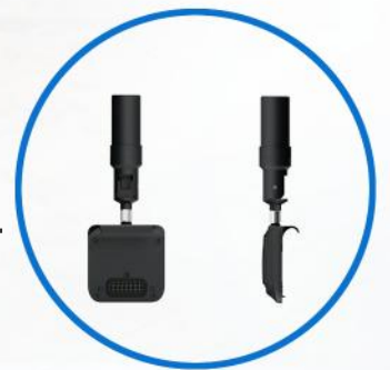
Removable High-precision Module

Open platform for 3rd party software applications.