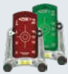
956 / 956G Optically Enhanced Target